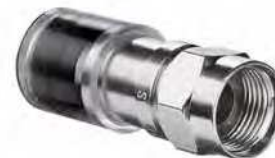
89-045 RG-6 Quad OmniConn™